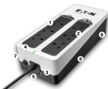
Eaton 3S 550