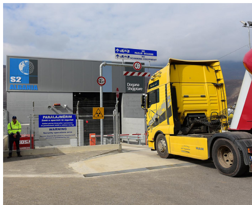
Trade & Transport Inspection