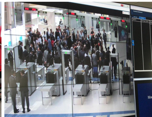
People & Packages Inspection

D eployed by commercial and government customers at over 60 large-scale sites worldwide, CertScan® has improved inspection—facilitating faster and more secure entry for trade, transport and events.