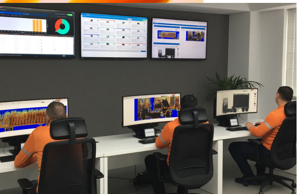
Command & Control

S2 Global's integration platform, CertScan® delivers unprecedented security and revenue focused inspection capabilities including 100% screening with faster throughput and dramatically better detection.