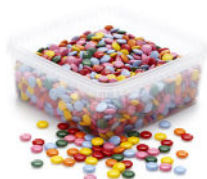
1.2 kg tub