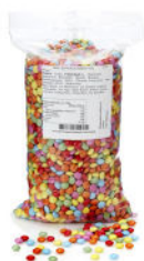
1 kg bag

The chocolate lentils come in different packages and volumes from bags, boxes/tubs, cartons to Big Bags of 600 kg.