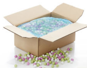
5 kg carton