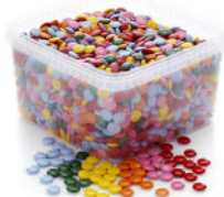
2.5 kg tub