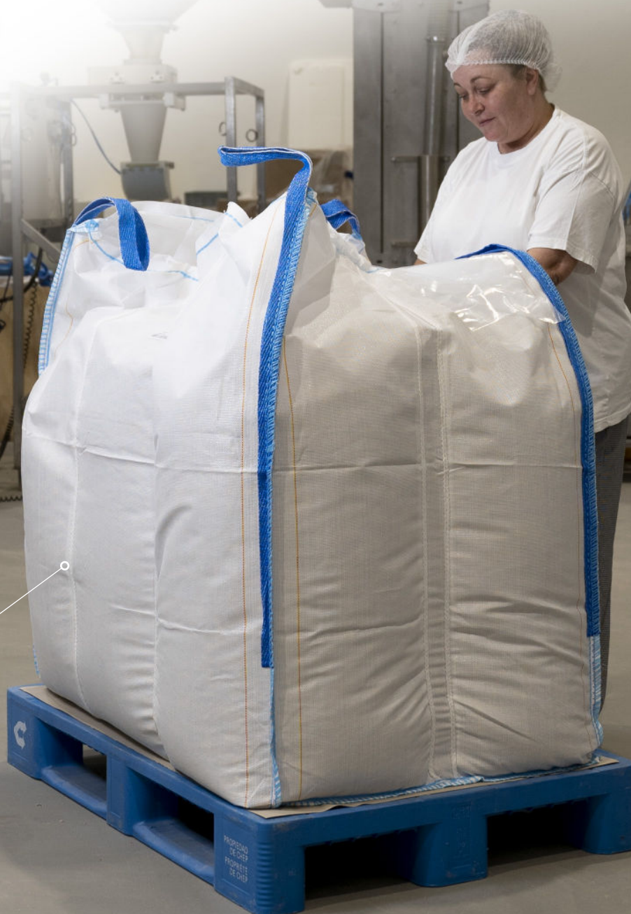
600 KG BIG BAG