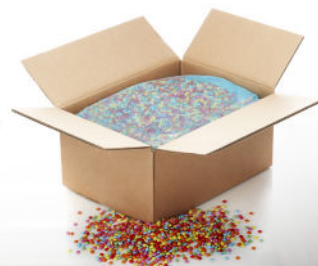
10-15 kg carton