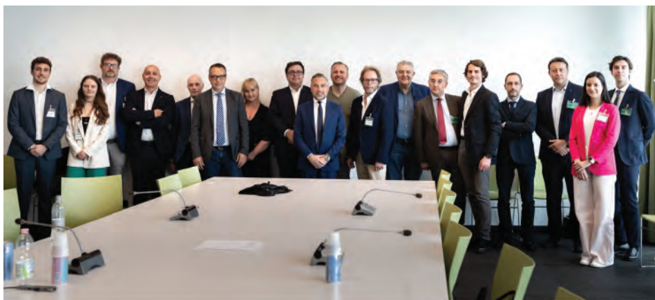
Garmin & SAT at FleetPREDICT Program Kick-off Event in Milan 2025

The findings demonstrate how the system transforms fatigue management from a reactive process into a proactive, data-informed safety strategy.