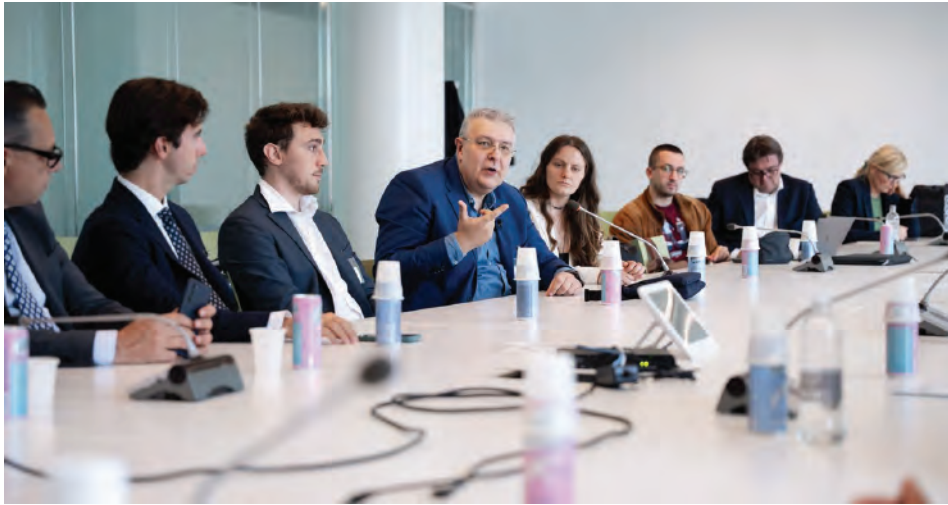
Garmin & SAT at FleetPREDICT Program Kick-off Event in Milan 2025