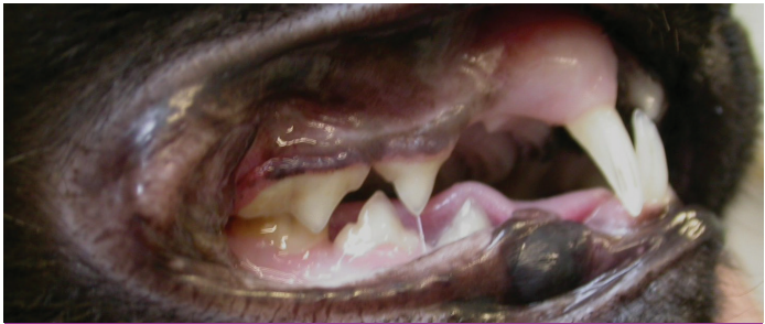
Healthy cat mouth

Cats do not appreciate how important tooth-brushing is and most are not very co-operative! However some cats will tolerate it so it's worth giving it a try!